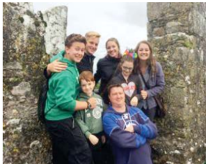
Our 16 year old Author is wearing the green hoodie

On Saturday July 29th, 2017, I arrived in Dublin, Ireland, along with a team of young adults. Our goal as a team was to go around to different local churches and public parks to put on kids clubs. We invite the