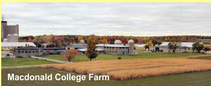
Macdonald College Farm

Macdonald College Farm Tour, Workshops, Testimonies, Gospel Singing, Prayer, Inspirational Messages, Food and Fellowship