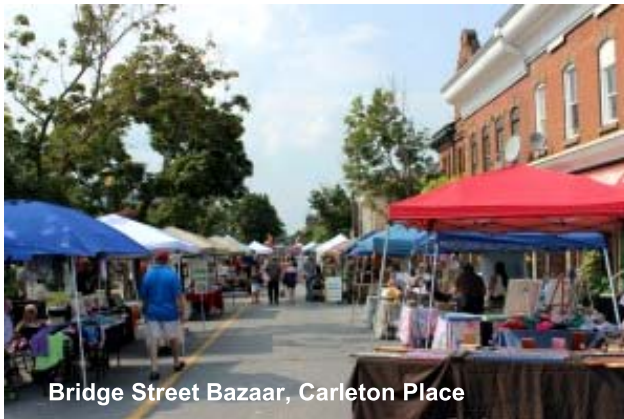
Bridge Street Bazaar, Carleton Place

The Lanark County Chapter continues to reach out to the area south of Ottawa. The two most recent events were at the Bridge Street Bazaar in Carleton Place, and the Lanark County Plowing Match.